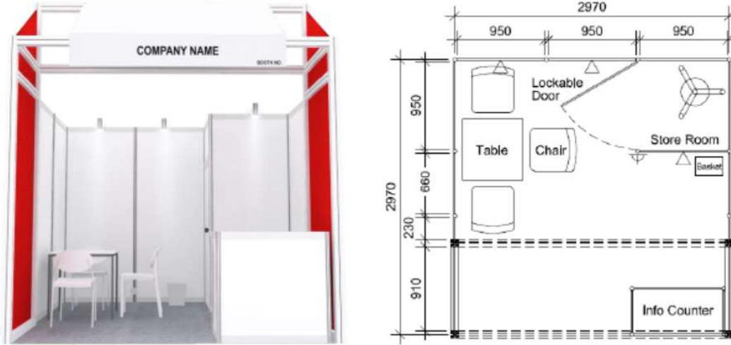
Standard Features and Equipment ASIA FRUIT LOGISTICA Complete Stand Package 标准展位特征与设施配置